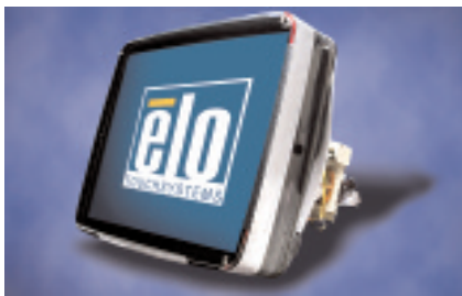
Touch the itouch tube directly— no touchscreen overlay needed